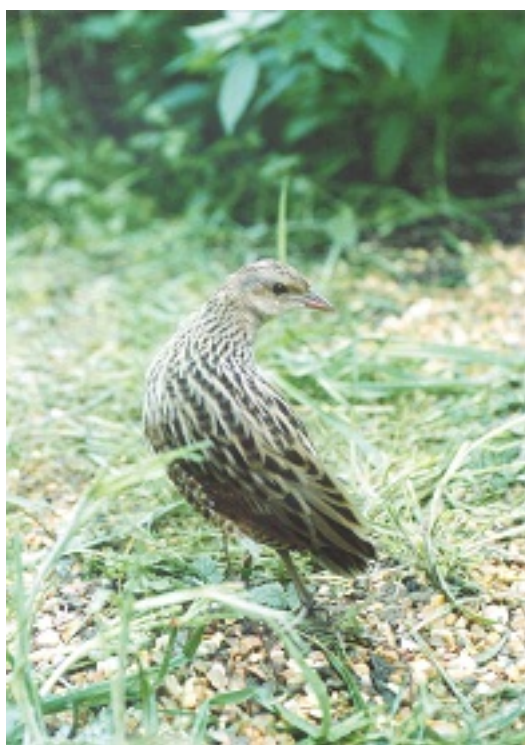
An Adult Corncrake